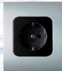
SOCKET OUTLET WITH CHILD PROTECTION For flush mounting 16A 250V~ Article B154