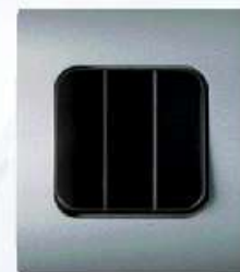
TRIPLE SWITCH For flush mounting 10AX 250V~ Article B16N