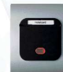
KEY CARD HOLDER SWITCH For flush mounting 10AX 250V~ Article B160 (one way) Article B160/2W (two way/change over)