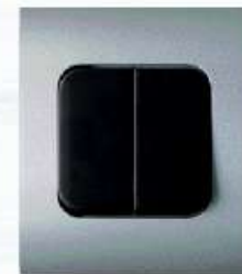
DOUBLE SWITCH For flush mounting 10AX 250V~ Article B162