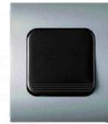
SINGLE PUSH ON PUSH OFF SWITCH For flush mounting 10AX 250V~ Article B167