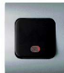
INTERMEDIATE SWITCH WITH INDICATOR LAMP For flush mounting 10AX 250V~ Article B16J