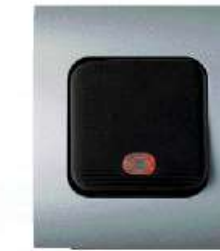
INTERMEDIATE PUSH ON PUSH OFF SWITCH WITH INDICATOR LAMP For flush mounting 10AX 250V~ Article B16K