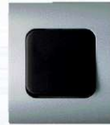
SINGLE SWITCH For flush mounting 10AX 250V~ Article B161