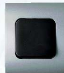
SINGLE CHANGE OVER SWITCH For flush mounting 10AX 250V~ Article B163