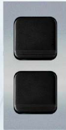
DOUBLE AND TRIPLE GANG COMBINATION