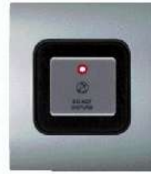
DO NOT DISTURB INDICATOR For flush mounting 230V- Article B141