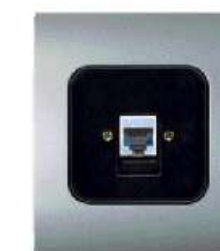
SINGLE NETWORK SOCKET OUTLET Cat.5e (RJ45) SCREW MOUNTING ONLY (WITHOUT CLAW) For flush mounting Article B174