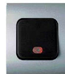
SINGLE PUSH ON PUSH OFF SWITCH WITH INDICATOR LAMP For flush mounting 10AX 250V~ Article B16A