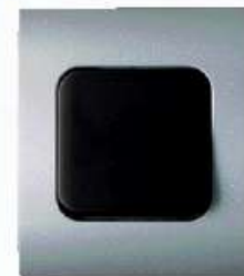
INTERMEDIATE SWITCH For flush mounting 10AX 250V~ Article B16G