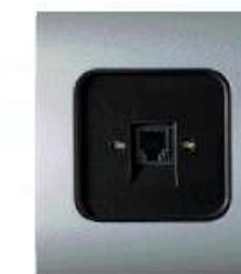
TELEPHONE SOCKET OUTLET For flush mounting Article B171