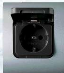
SOCKET OUTLET WITH HINGED COVER For flush mounting 16A 250V~ Article B152