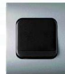
SINGLE PUSH ON PUSH OFF CHANGE OVER SWITCH For flush mounting 10AX 250V~ Article B169