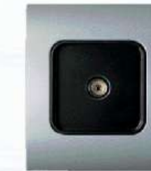
ANTENNA SOCKET OUTLET FOR TV ONLY For flush mounting Article B183