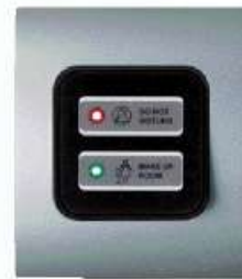
DO NOT DISTURB & MAKE UP ROOM INDICATOR For flush mounting 230V- Article B142