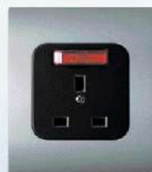
BRITISH STANDARD SOCKET OUTLET WITH SWITCH, INDICATOR LAMP & CHILD PROTECTION For flush mounting 13A 250V~ Article B155