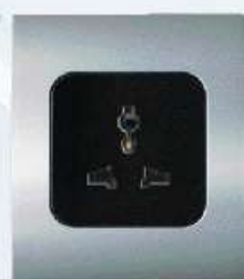
UNIVERSAL SOCKET OUTLET For flush mounting 13A 250V~ Article B15B