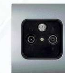
SATELLITE ANTENNA SOCKET OUTLET For flush mounting Article B184