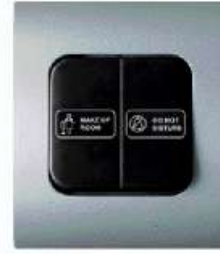
DO NOT DISTURB & MAKE UP ROOM SWITCH For flush mounting 10A 250V- Article B16L/DND-MUR