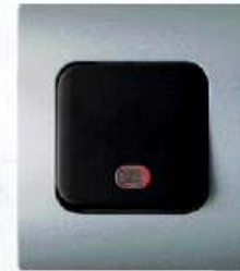
SINGLE CHANGE OVER SWITCH WITH INDICATOR LAMP For flush mounting 10AX 250V~ Article B16D