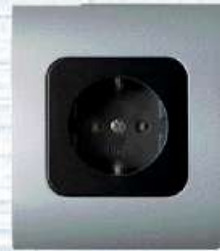
SOCKET OUTLET For flush mounting 16A 250V~ Article B151