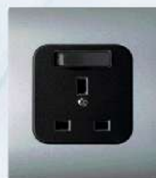
BRITISH STANDARD SOCKET OUTLET WITH SWITCH & CHILD PROTECTION For flush mounting 13A 250V~ Article B157