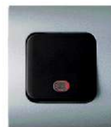
TWO POLE SWITCHES WITH INDICATOR LAMP For flush mounting 20AX 250V~ Article B16F