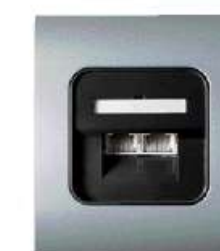
DUAL TELEPHONE / DUAL UNIVERSAL NETWORK SOCKET OUTLETS (RJ45/RJ12/RJ11) For flush mounting Article B176