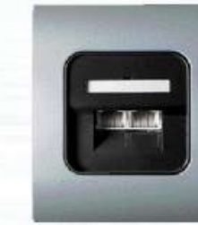
DUAL UNIVERSAL NETWORK SOCKET OUTLETS Cat.5e (RJ45) For flush mounting Article B177