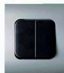
DOUBLE CHANGE OVER SWITCH For flush mounting 10AX 250V~ Article B164