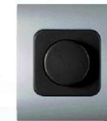
DIMMER FOR INCANDESCENT LAMP WITH PUSH ON PUSH OFF SWITCH For flush mounting 60 - 500W 220V~ Article B191 (one way) Article B191/2W (two way/change over)