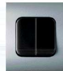
DOUBLE PUSH ON PUSH OFF SWITCH For flush mounting 10AX 250V~ Article B168