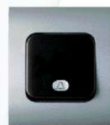
SINGLE PUSH BUTTON SWITCH For flush mounting 10AX 250V~ Article B165