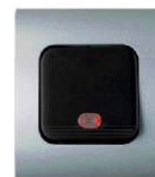
SINGLE PUSH ON PUSH OFF CHANGE OVER SWITCH WITH INDICATOR LAMP For flush mounting 10AX 250V~ Article B16B