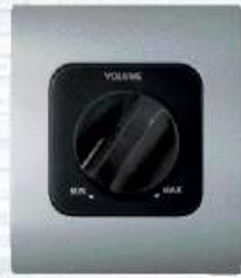
VOLUME CONTROL For flush mounting 24W 100V Article B186