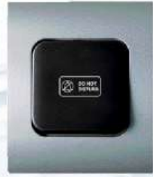
DO NOT DISTURB SWITCH For flush mounting 10A 250V- Article B163/DND