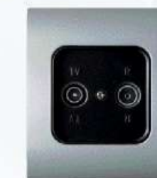
ANTENNA SOCKET OUTLET FOR TV AND RADIO SINGLE USE For flush mounting Article B181