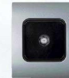
TV CABLE SOCKET OUTLET F TYPE CONNECTOR SCREW MOUNTING ONLY (WITHOUT CLAW) For flush mounting Article B185