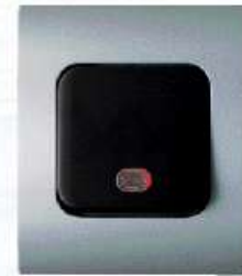
SINGLE SWITCH WITH INDICATOR LAMP For flush mounting 10AX 250V~ Article B16C