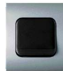
INTERMEDIATE PUSH ON PUSH OFF SWITCH For flush mounting 10AX 250V~ Article B16H