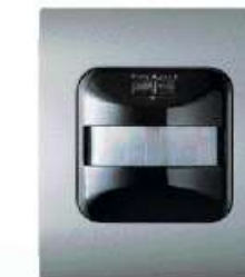
MOTION SENSOR SWITCH For flush mounting 500W 220V~ Article B195